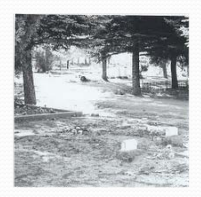
Monroe City Cemetery Gravesite