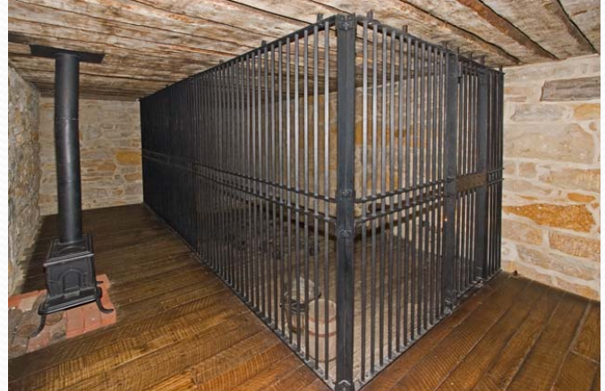
Jail