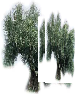
Wild Trees- Different parts of the World