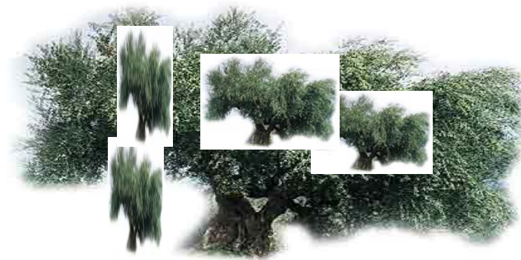
Natural Olive Tree- Israel

Go to Israel, Gathered in here Fall of Jerusalem, Last Days Just before Qadisha's 100th Ages for the Millers 2019 Jacob 45-49