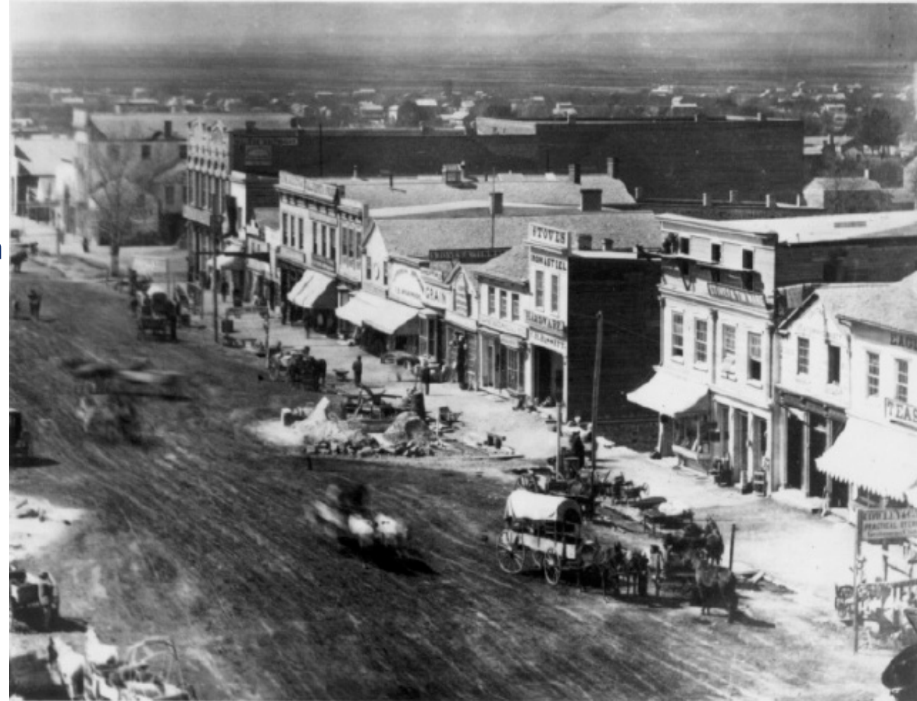
Main Street, Salt Lake City, 1860

I realize the blessings of God in our present safety. We are greatly blessed, greatly favored and greatly exalted, while our enemies, who sought to destroy us, are being humbled.