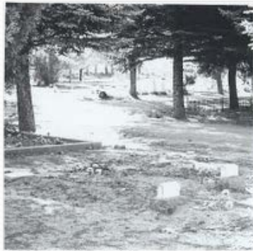
Monroe City Cemetery Gravesite

If they do, I will be a lion in their path! Don't flinch. If you have to die; die like men; you will be martyrs to the cause, and your crowns can be no greater. But," said he, again, "I hardly think they will shed your blood."